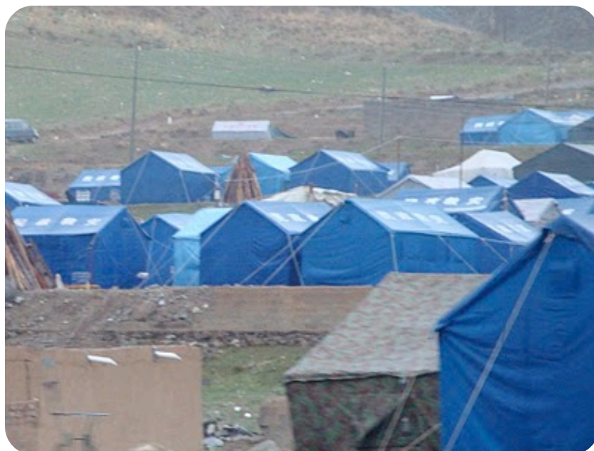
Emergency tents provide shelter for those who have lost their homes.

Thank you to those who have already renewed! Electronic reminders are sent individually throughout the year in accordance with each sponsor's past payment schedules.